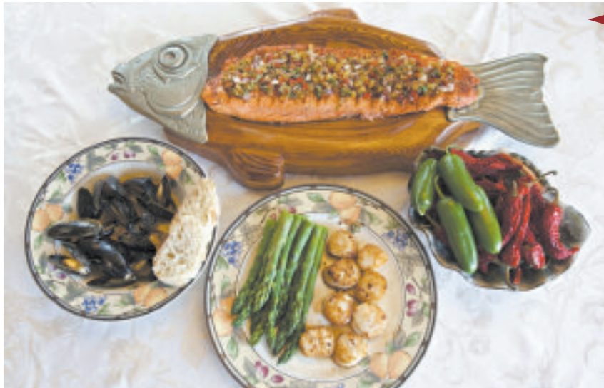
Dishes from Ingrid Baier's cookbook Fish On include grilled salmon with pineapple salsa (top), scallops sauteed in Grand Marnier and garlic (middle) and Thai curry mussels (left).

"We learned by doing," she said. "People didn't worry as much and we were allowed to go out fishing at 16 or 17 by ourselves."