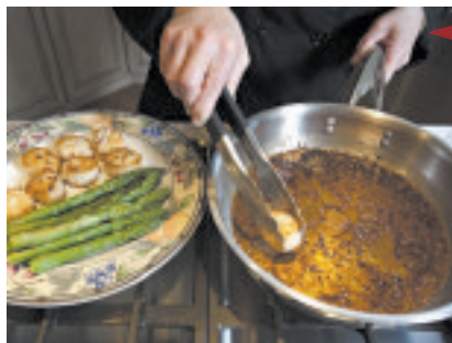
Sauteed scallops in Grand Marnier and garlic accompany asparagus.